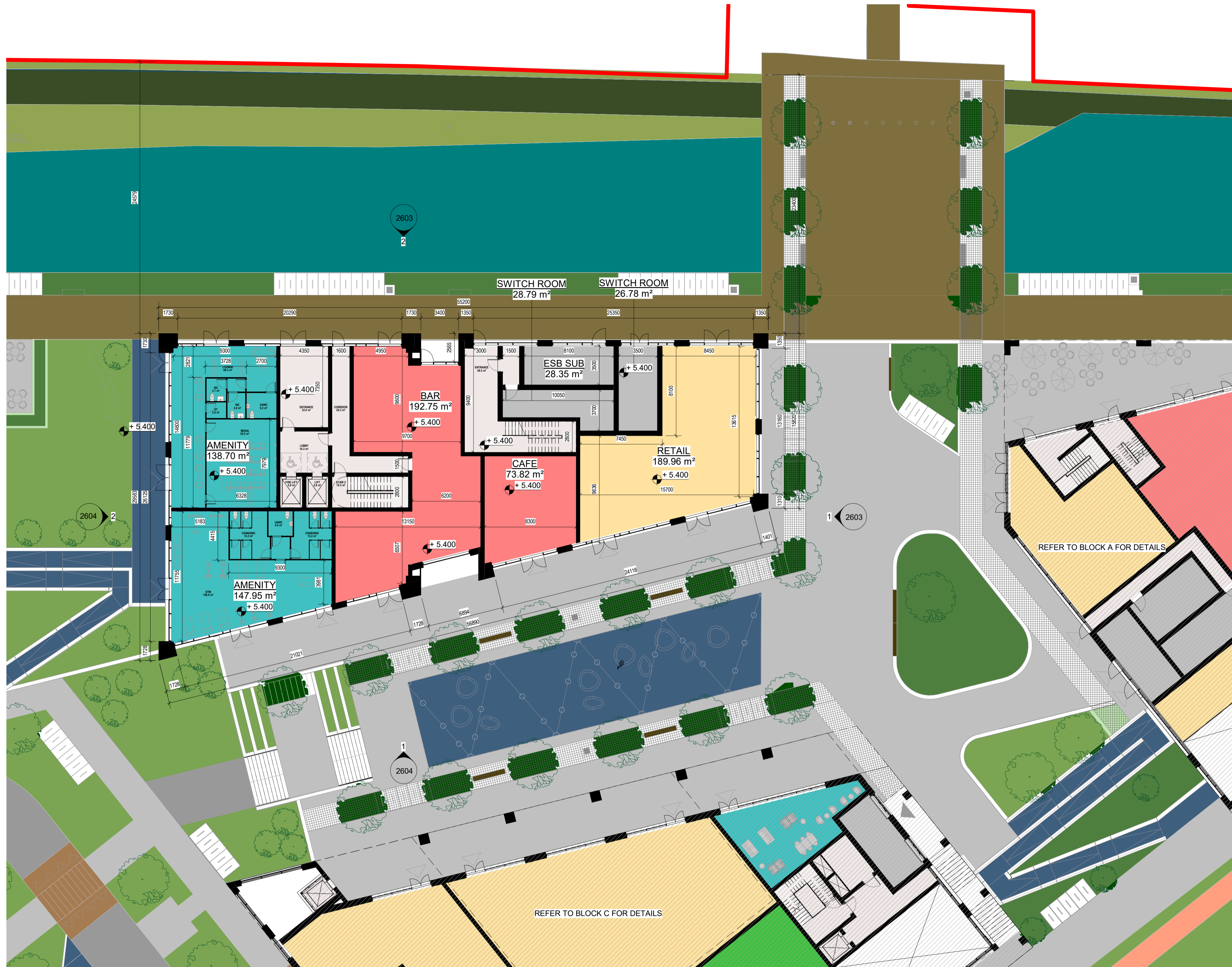
1 PLAN - BLOCK B - LEVEL 00 1:200

Please consider the environment before printing this sheet